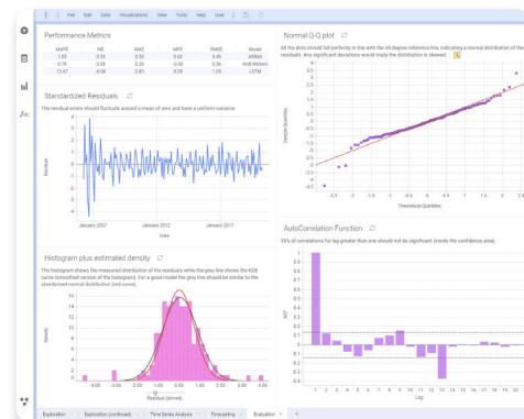
Spotfire® Industry Pro analysis