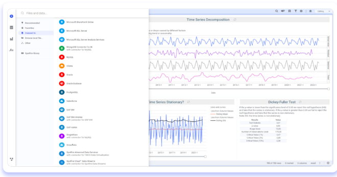
Figure 1: Connect to any data source in Spotfire

Spotfire Enterprise offers a robust set of features designed to meet the needs of large organizations. By providing a scalable and reliable analytics platform, it supports everything from real-time data analysis to advanced predictive modeling.